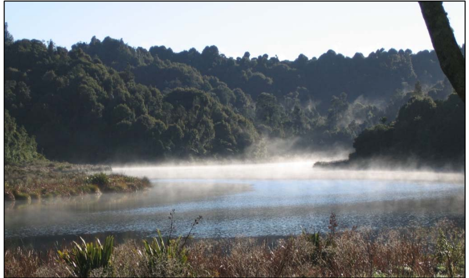
Rotokare Mists