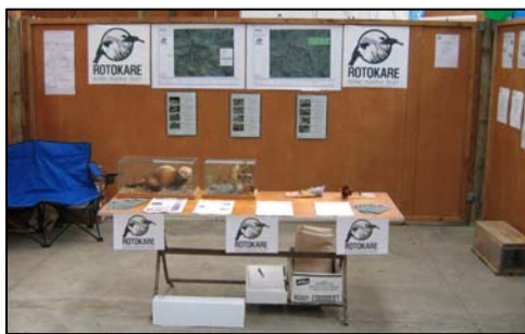
Egmont A&P Show display – M.Sulzberger