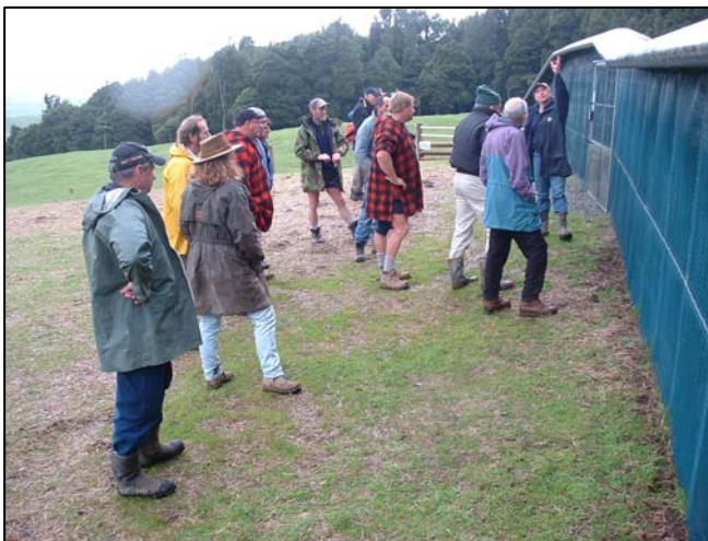
A section of fence at Maungatautari - Oecologico