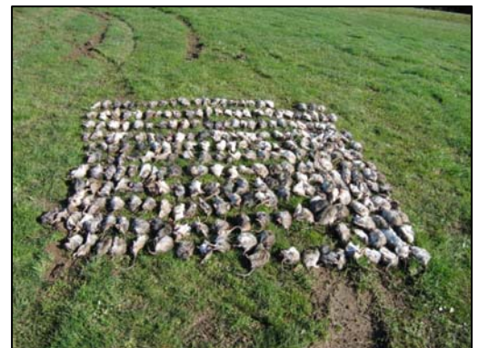
Many dead rats