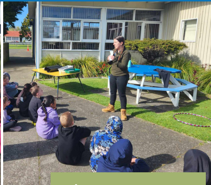
Both images are from the 'Sparky the Kiwi' event recently run at Egmont Village Primary, and Waitara Central School